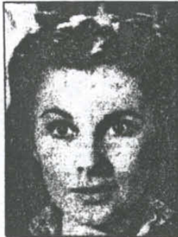
Vivian Leigh 1936